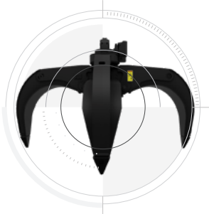
GSV – ORANGE PEEL GRAPPLES