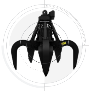
DEMO AND SORTING GRAPPLES